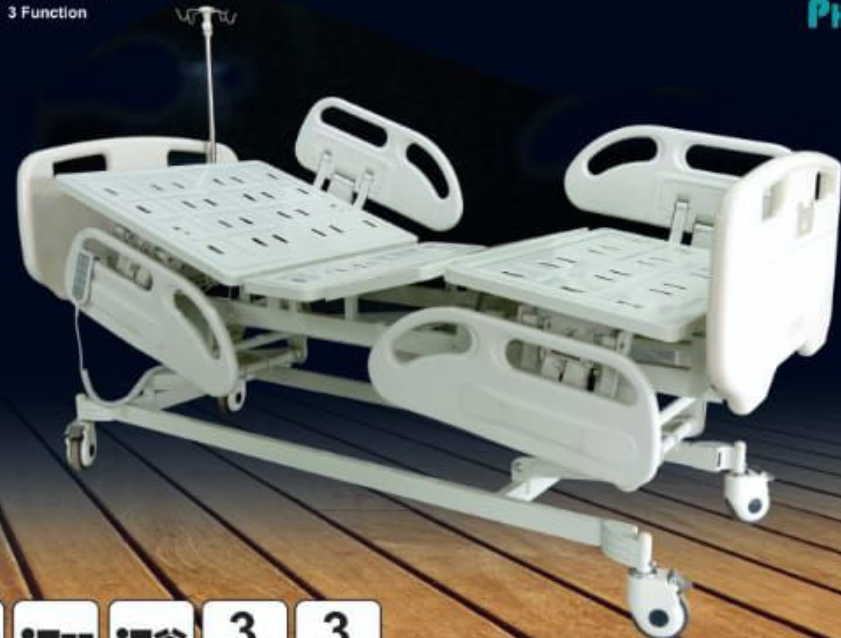
ICU Electrical Bed 3 Function