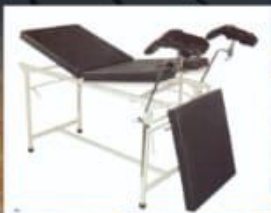
Obstetric Delivery Table